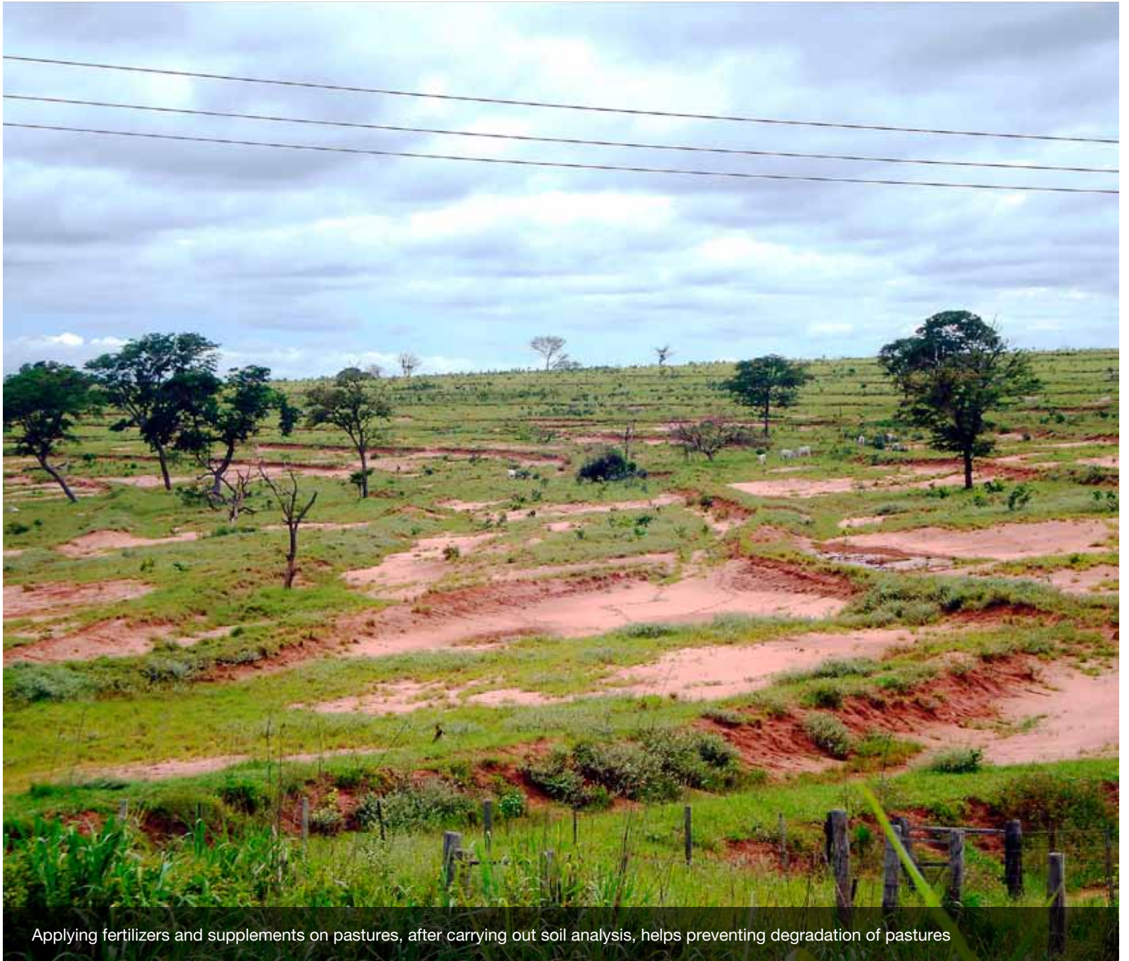
Applying fertilizers and supplements on pastures, after carrying out soil analysis, helps preventing degradation of pastures